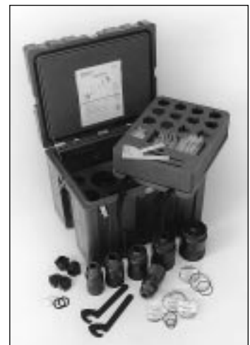
Kit #2: As shown for 1" to 2-1/2" pipe sizes, service to 300 psi (21 bar)