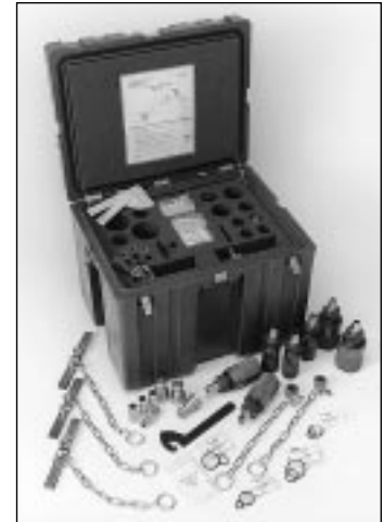
Kit #1: As shown for 1/4" to 3/4" pipe sizes, service to 4,000 psi (275 bar)

Specifications may be subject to change without notice.