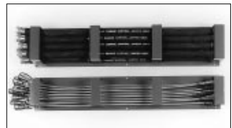
Jumper hose assemblies for low pressure (above) and high pressure (below).